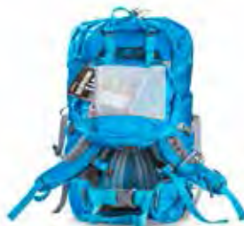
TOP LID POCKET 50L / 36L / 26L