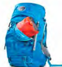
FRONT PANEL ACCESS 50L / 36L