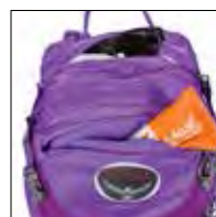
ZIPPERED SLASH POCKETS 34L / 24L